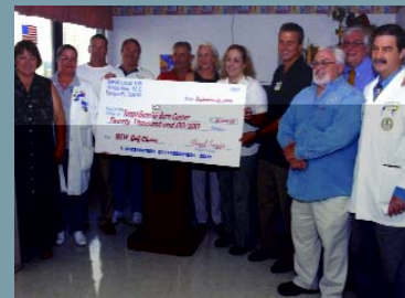
IBEW Local Union 108 presents a check from their Annual Golf Classic to the TGH Burn Center.

Golden Tree of Life An honor and memorial gift program that recognizes special and momentous occasions, and/or honors the memory of a loved one. Each leaf on the Golden Tree of Life represents a gift of $1,000 or more.