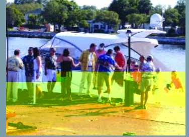
Guests arriving at the "Moments in Time" Beach Bash by yacht.