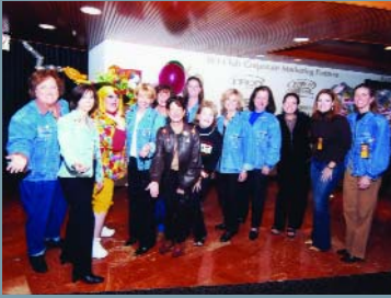
The Foundation's 13th Annual "Night at the Circus" Committee.