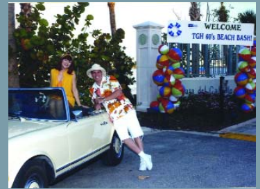
Performers at the "Moments in Time" Gala welcome guests to the party.